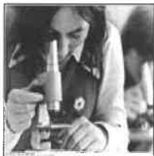
4 Spectator's Pix: Unusual Jobs