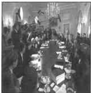
7 Obama's Cabinet