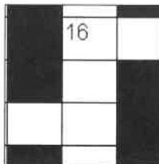
10 A Politically-minded Crossword