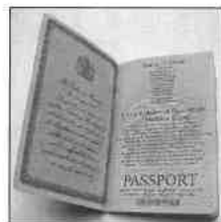
11 Immigration Reform