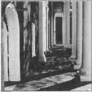
5 Avoiding Freshman Folly