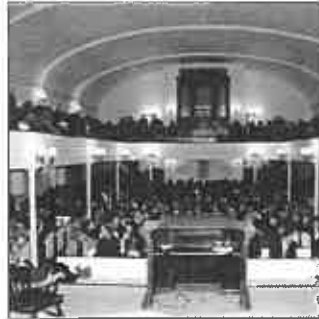
6 Orientation Week Redux