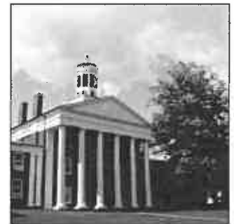
13 By the Numbers: Washington & Lee and the World