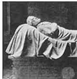
10 Confederate Museum not in Lexington