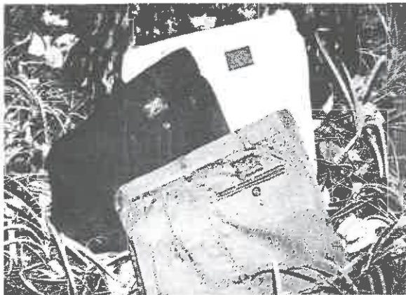
Cotton Prewashed Twill and Brushed Cotton Slacks with Reverse Pleat Front. Colors: Khaki, Navy, Olive. Men's 30"-42" (Even & Odd Waist sizes) Laundered Chino: $48.00. Brushed $49.00. Sizes 44" 46" 48"- $58.00