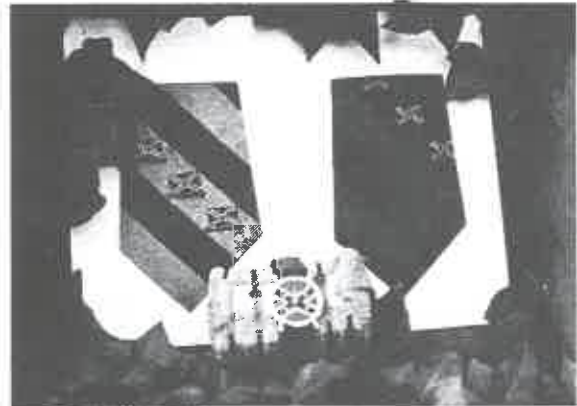
Finest Pure Silk Ties Made by America's Finest Tie Maker. University Bar Striped with Embroidered Flag Logo. Colors: Red/Navy Khaki/Forrest $47.50